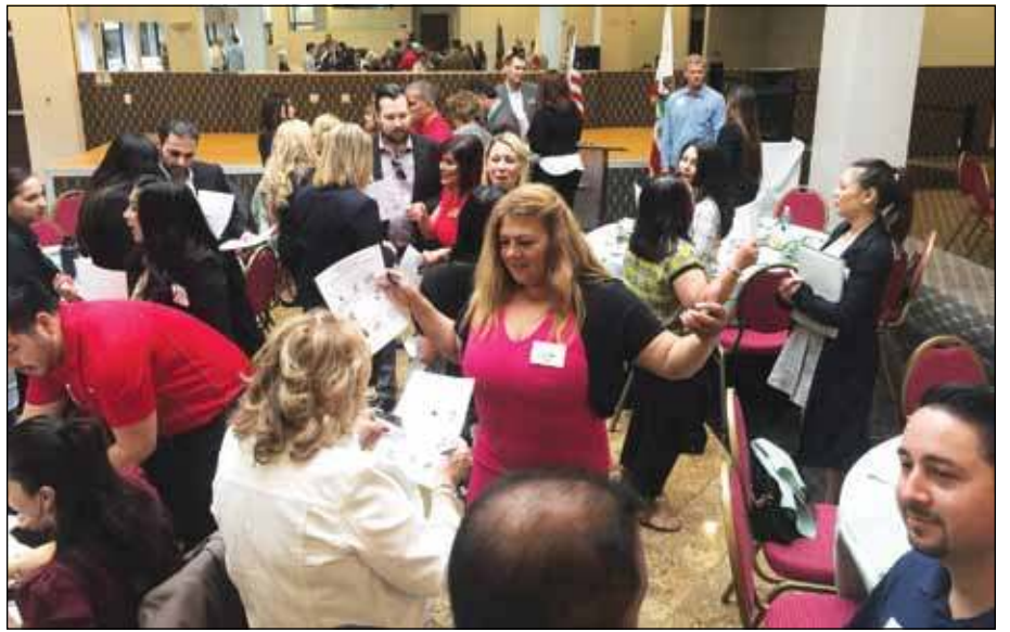
The networkers were really working the room at the June BCX.